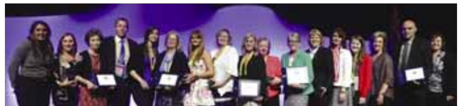
Chapters renewing their Stellar School status in 2015 were also recognized at the NSNA Annual Convention.