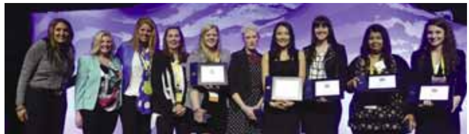
NSNA school chapters were welcomed as Stellar School members at the NSNA Annual Convention in 2015.